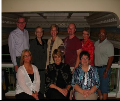
NN2 Board of Directors