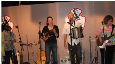
Great Western entertainment!