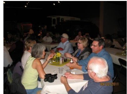
More networking, for which NN2 is famous!