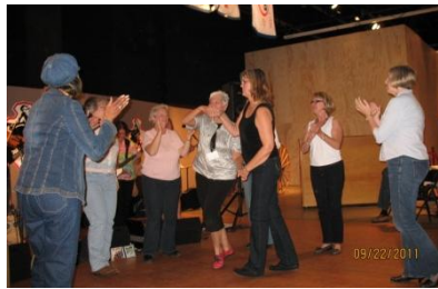
NN2 members learn to dance the Wyoming way!