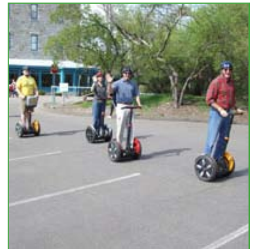
After the conference sessions, HPN members take time to enjoy the scenery along the Mississippi River in downtown Minneapolis